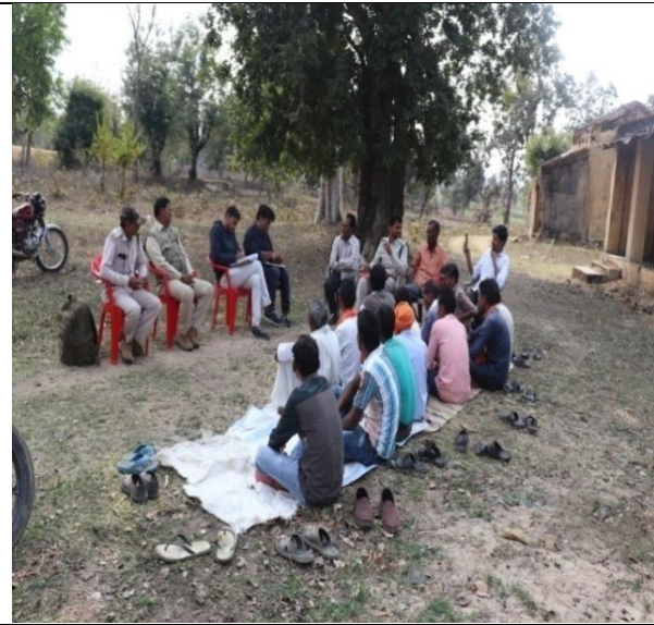
Group discussion with medicinal plant traders and collectors

75 Nos. of village level market traders surveyed in different districts of Madhya Pradesh namely Umaria, Katni, Shehdol, Mandla, Balaghat, Seoni , Chhindwara, Neemuch, Mandsaur, Dewas, Indore .