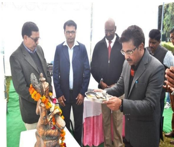
One -day training workshop on Conservation resource augmentation and non-destructive harvesting of Guggul, at Eco-centre, Deori, Morena, Madhya Pradesh held on 29.01.2019