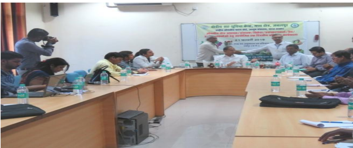
One-day Stakeholders meet on cultivation of medicinal plants at Raipur Chhattisgarh held on 21.02.2019.