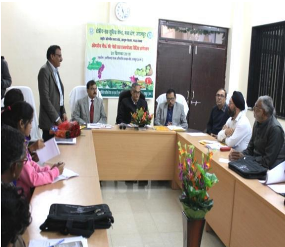
Training on cultivation of medicinal plants at Raipur and Exposure visit to cultivators fields in Korba district of Chhattisgarh .held on 20 & 21 Dec. 2018