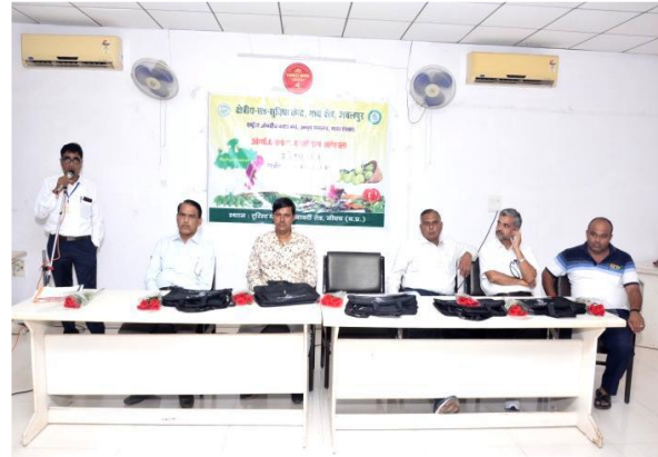
ONE DAY TRAINING PROGRAMME FOR FARMERS ON CULTIVATION OF MEDICINAL PLANTS held on 12.09.2018 at Tourist Motel, Neemuch