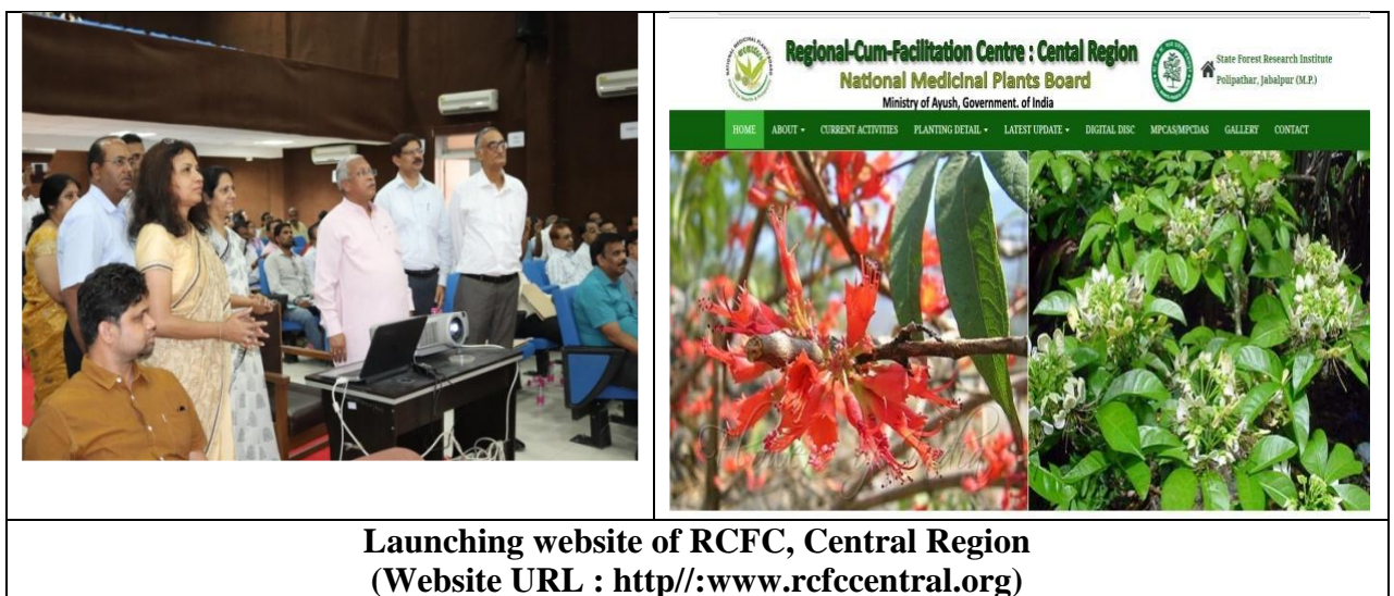
Launching website of RCFC, Central Region (Website URL : http://www.rcfccentral.org )