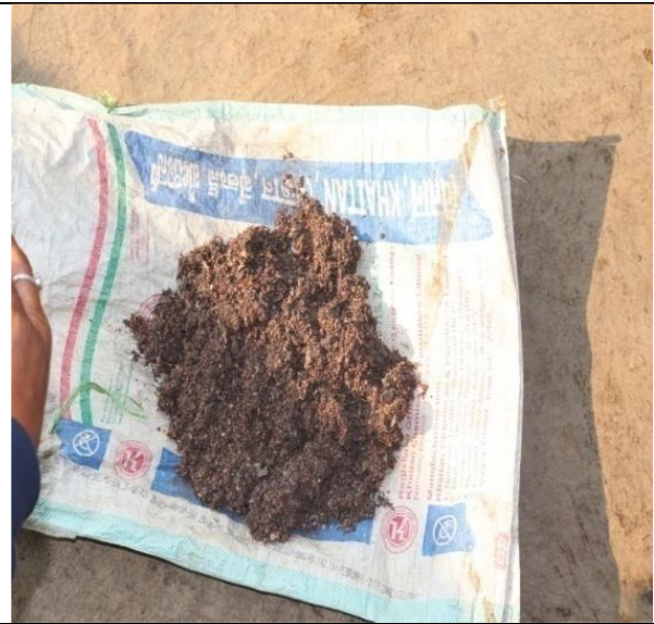
lac collected by the collectors at Lamta