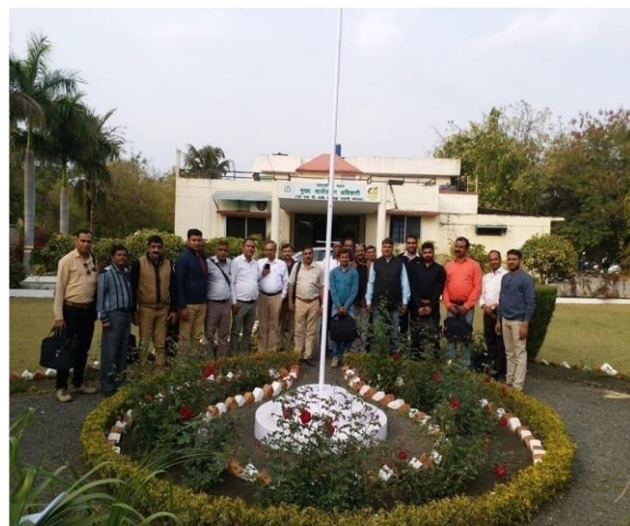
One day exposure visit for stakeholders of Chhattisgarh and Madhya Pradesh at MFP ParcBarkhedaPathani, vindya herbal Bhopal (M.P.) held on 13.02.2019