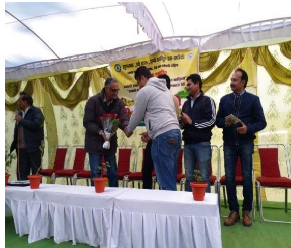
One-day training on development of workable field model for conservation and sustainable harvesting of naturally occurring medicinal plants at Dhurkuta Forest, Dindori Division (M.P.) held on 08.01.2019