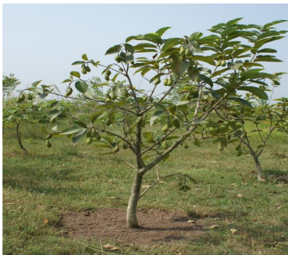
Plantation of Raj Harad ( Terminalia chebula ) at Jammu