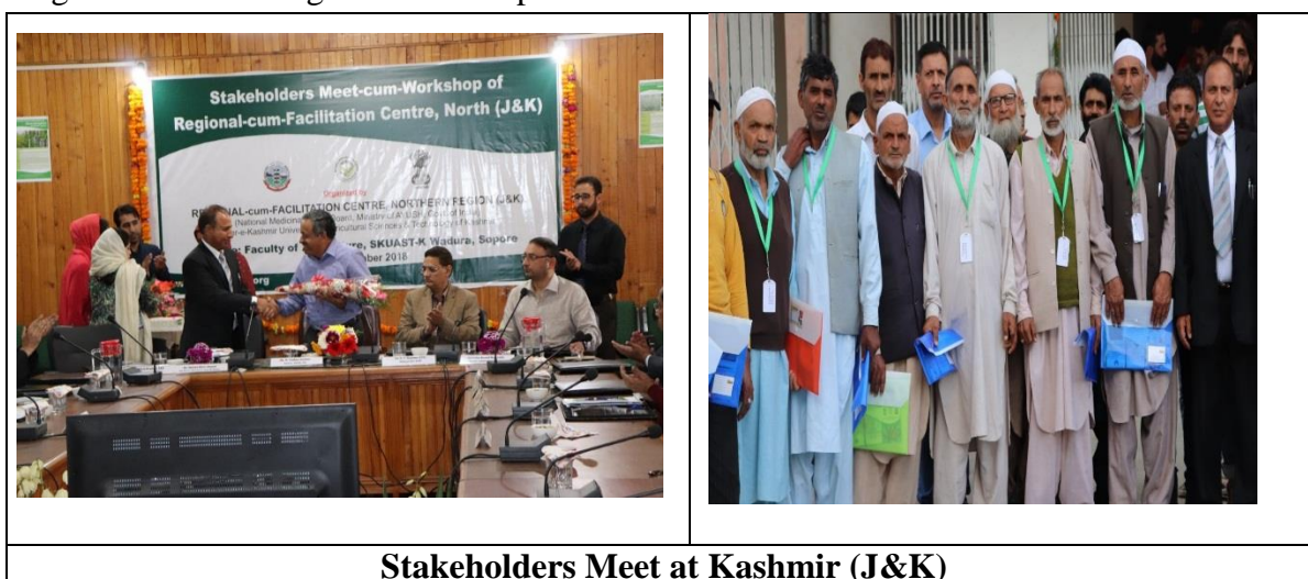
Stakeholders Meet at Kashmir (J&K)