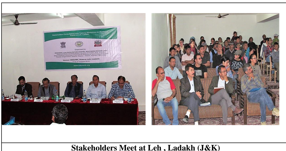
Stakeholders Meet at Leh , Ladakh (J&K)

plants, production of QPM and marketing of medicinal plants. A data base of stakeholders was also generated for the Ladakh region.