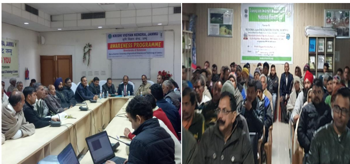
Awareness programme at KVK Jammu