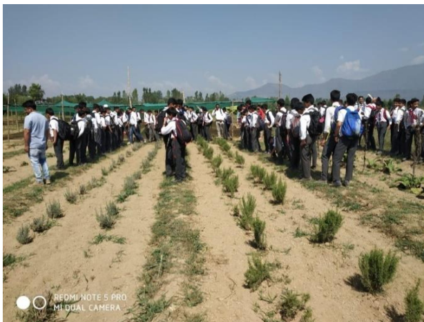
Exposure visit at Leh Laddakh

Kisan Melas organized/participated: 2 nos.