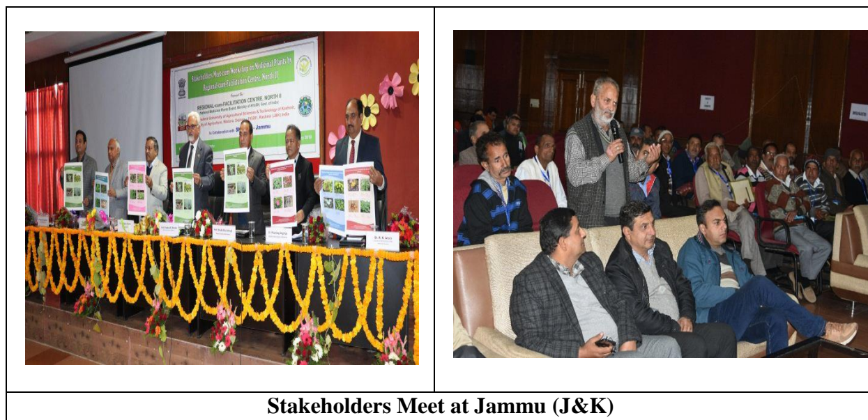
Stakeholders Meet at Jammu (J&K)